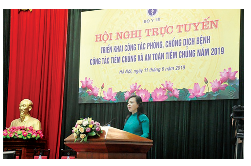
Minister of Health Nguyen Thi Kim Tien speaks at the teleconference on June 11.

In addition, disease prevention and control is still facing difficulties due to diseases such as dengue fever or handfoot-mouth disease which are still without specific drugs and preventive vaccines, while epidemic prevention and control activities are mainly based on the community and public self-awareness.